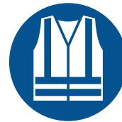
HIGH VISIBILITY CLOTHING